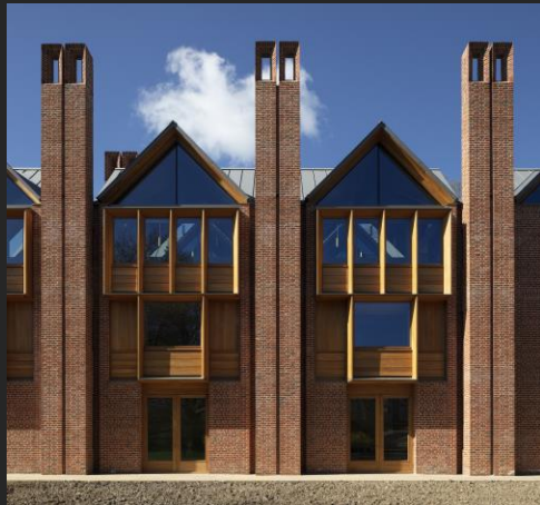
The New Library – Stirling award winner Níall McLaughlin Architects Magdalene College, Cambridge