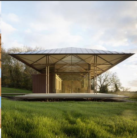
New Pavilion Níall McLaughlin Architects Isle of Wight