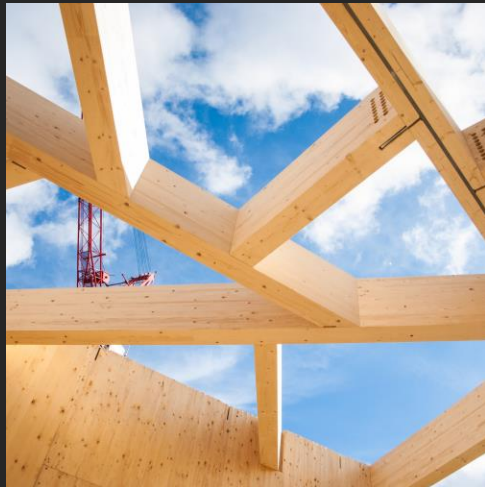
Stephen Perse Foundation School Chadwick Dryer Clarke Architects Cambridge