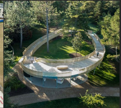
Botanic Gardens Rising Path Chadwick Dryer Clarke Architects Cambridge Botanic Gardens