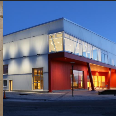
Barkarby School Sweden Liljewall arkitekter Jarfalla kommun