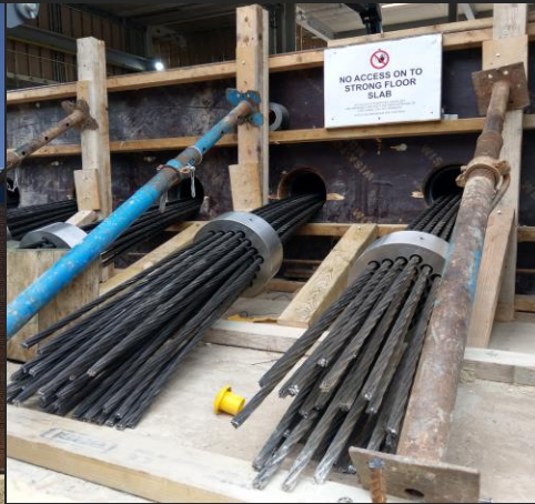
Engineering Department Grimshaw architects University of Cambridge