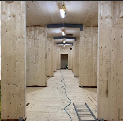
Lucy Cavendish College R H Partnership Architects Cambridge